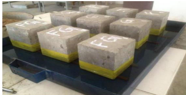
Specimens testing for sorptivity

above the base of the specimen and the flow from the peripheral surface is prevented by sealing it properly with non-absorbent coating or sealing with the plaster.