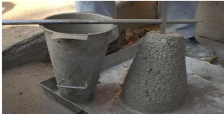
Slump Test in progress

Slump test is the most commonly used methods and measuring the consistency of concrete, which is employed in the laboratory or at the site work. In the present work, slump tests were conducted as per IS: 1199 – 1959 for all mixes. It is not a suitable method for vary wet or dry concrete. This method is suitable for medium slump.