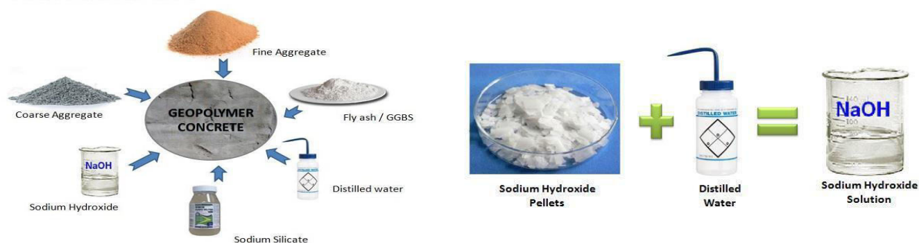
Constituents in Mix design of Geopolymer Concrete